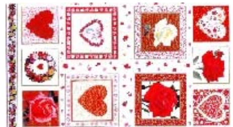
830 (7" & 10" squares) PANEL (60 x 112cm)