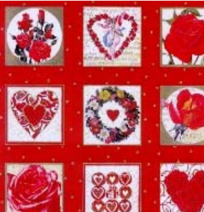
820 R (3" squares)