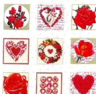
820 Q (3" squares)