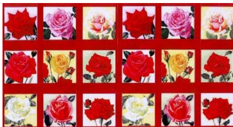
831 (6" squares) PANEL (60 x 112cm)